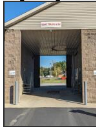
PXL 20231013 143551009 copy