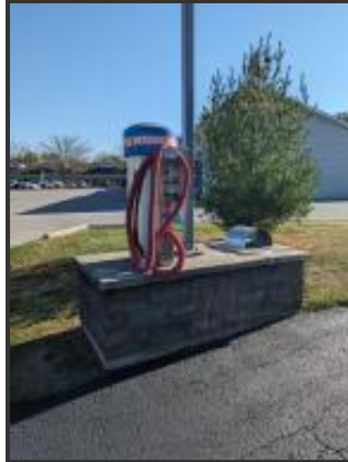
PXL 20231013 143301543 copy